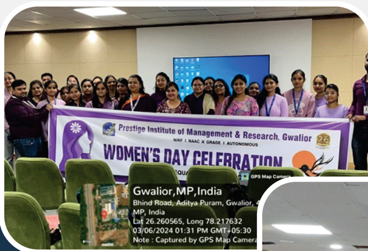
Gwalior, MP, India Bhind Road, Aditya Puram, Gwalior, MP, India Lat 26.260565, Long 78.217632 03/06/2024 01:31 PM GMT+05:30