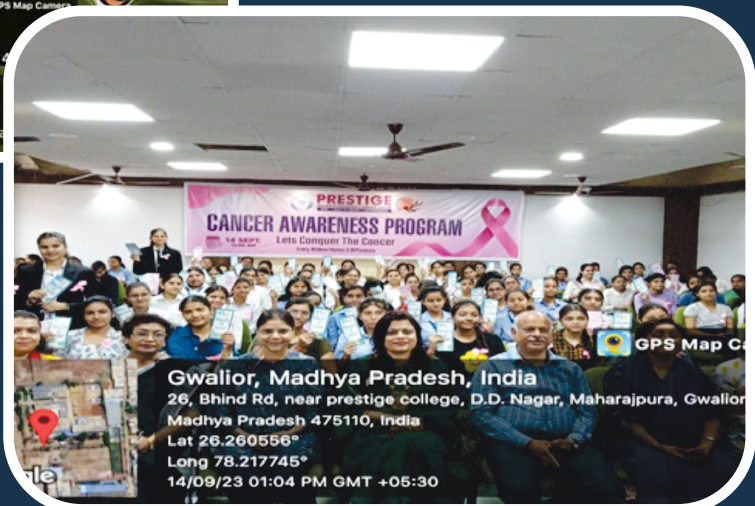
Gwalior, Madhya Pradesh, India 26, Bhind Rd, near prestige college, D.D. Nagar, Maharajpura, Gwalior Madhya Pradesh 475110, India Lat 26.260556° Long 78.217745° 14/09/23 01:04 PM GMT +05:30