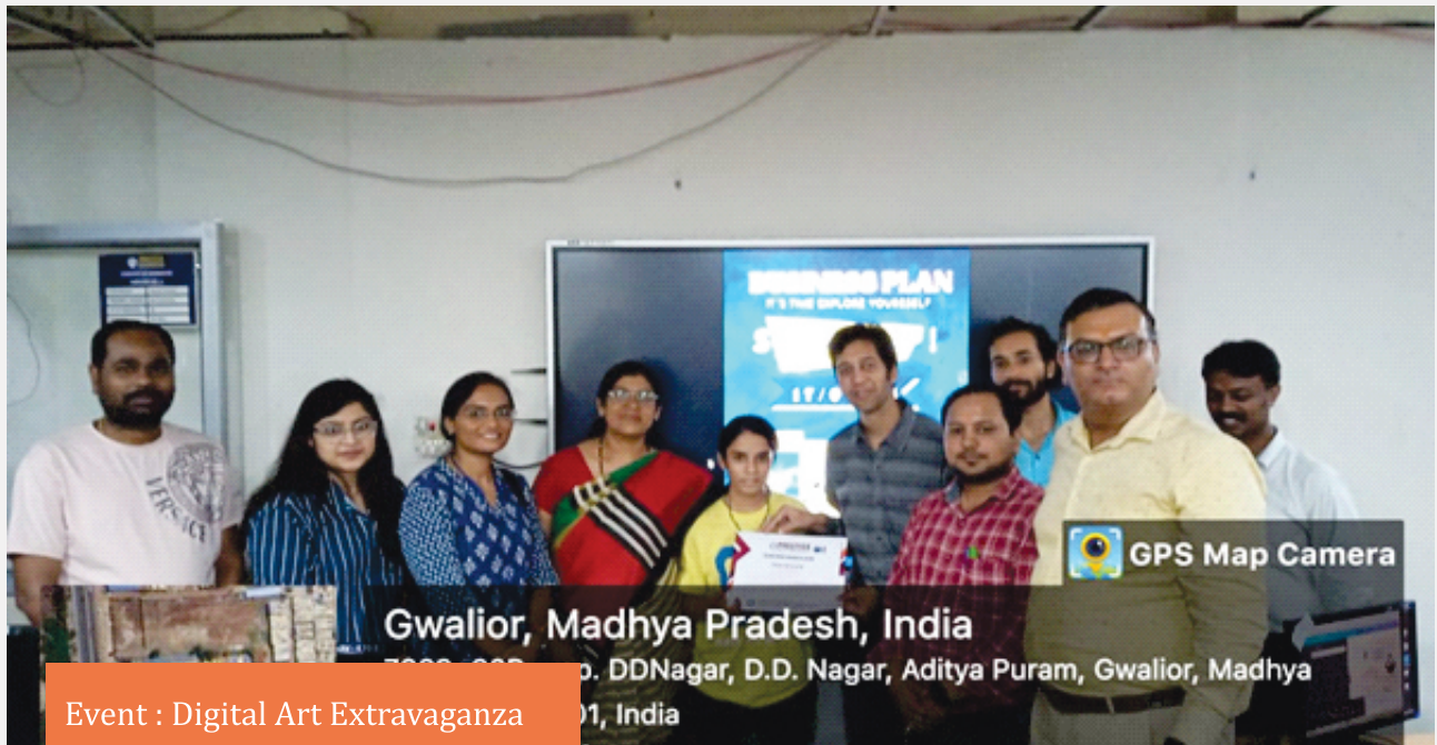
Event : Digital Art Extravaganza

The Digital Art Extravaganza was organized on 16th September 2023 at Lab 3 & 4 with the participation of 64 registered members, out of which 52 students actively took part. The event aimed to promote AI integration in design, enhance creativity through AI-powered tools, and strengthen digital proficiency among students. It also emphasized collaboration, problem-solving, and effective communication in the context of digital art and design.